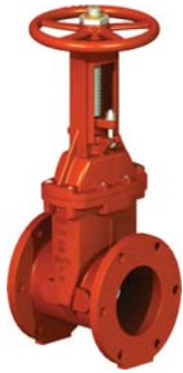
AWWA C515 Ductile Iron Resilient Seat Gate Valves, OS&Y (250/300 Flanges)