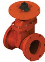
AWWA C515 Ductile Iron Resilient Seat Valves, NRS, w/Post Indicator Plate (250/300 Flanges)